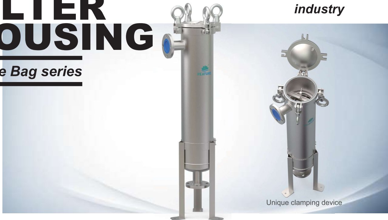
Unique clamping device

ECS single-bag filter housings with side inlet piping connections and bottom outlet are a perfect choice for cost-sensitive applications. The side inlet piping connections can be adapted to different directions, according to your specific needs. The simple design allows an easy cleaning of the interior. Precision castings and swing eye-bolt closure guarantees integrity even at high pressures.